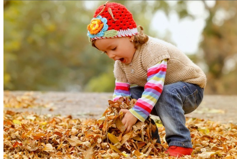
White Valley Parks, Recreation and Culture